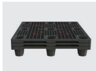
Easy forklift entry when nested