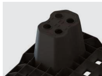
Strong legged structure