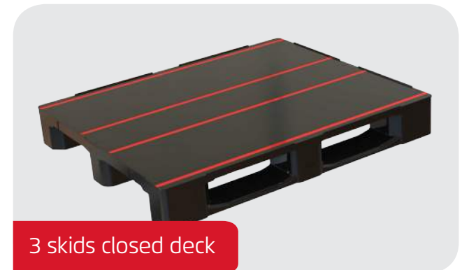
3 skids closed deck