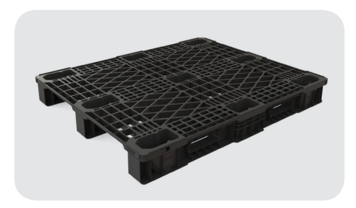
Open deck (optional)