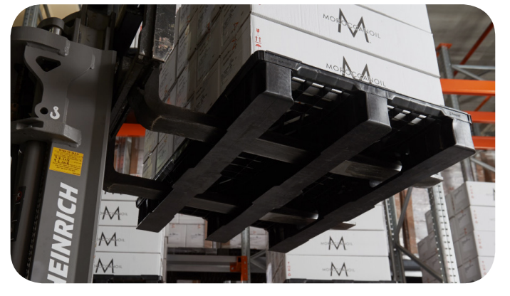
Smooth bottom surface