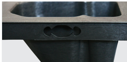
* Special feature designed to enable secure wrapping of goods