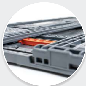
Great folding ratio