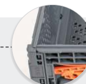
Upper perimeter edge to avoid deflection