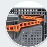
Ergo-lock system, soft opening prevents injuries