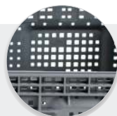
Better ventilation – Specially in the upper part