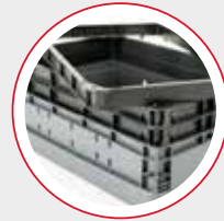
EXTENDED HEIGHT Attachable frame for extra height