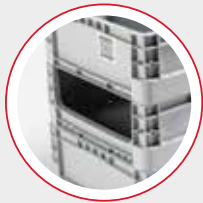
OPEN FRONT FOR PICKING