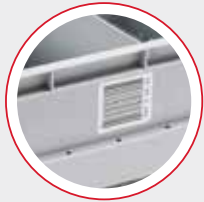
TRACKING AND MARKING OPTIONS